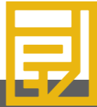
ExpoMant Magazine (Print and digital)