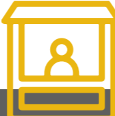
Stands and Islands Islands