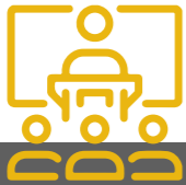
Participation in Technical Forums

ExpoMant offers you several advertising channels to amplify the presence of your brand in the event such as: